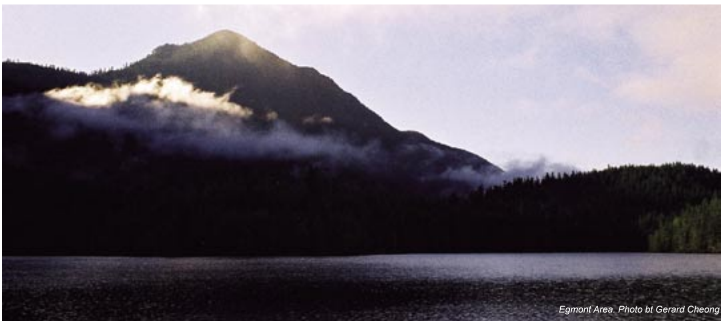
Egmont Area.