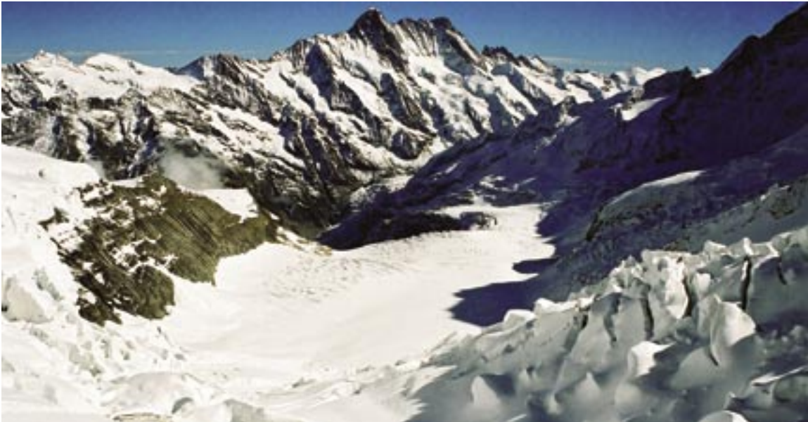
View from inside the Eiger.

Alpine Club of Canada - Vancouver Section News